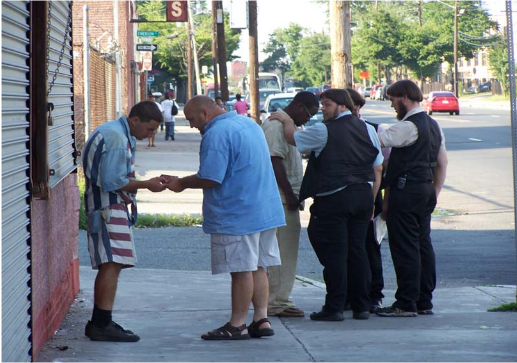
Four Amish brothers from Pennsylvania have committed to pray for the Seth Boyden neighborhood every day.